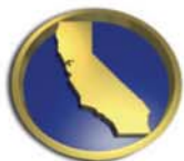
California Title Company