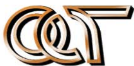
Orange Coast Title Company